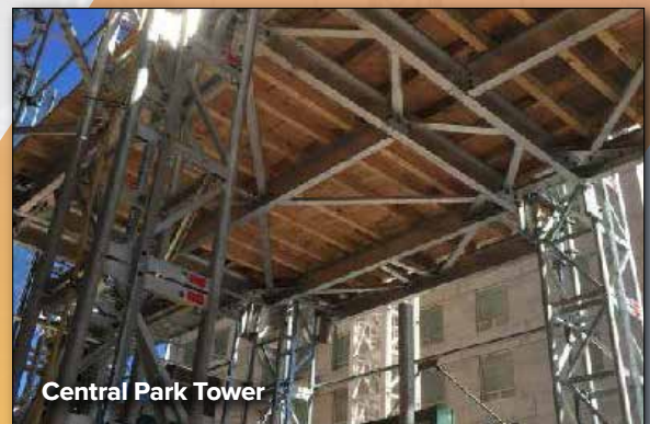
Central Park Tower